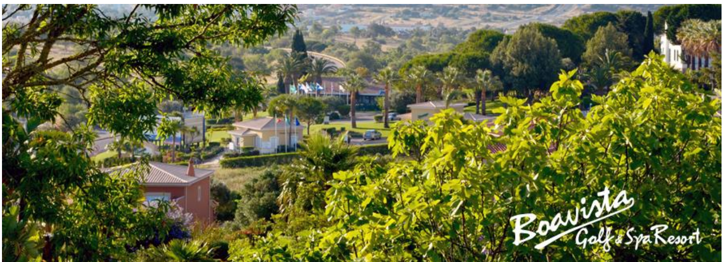
View from the tower room to the Boavista golf course

If you like to order a taxi upfront, please use the address of “Boavista Golf & Spa Resort” as follows: Boavista Golf & Spa Resort . Quinta da Boavista . 8601-901 Lagos